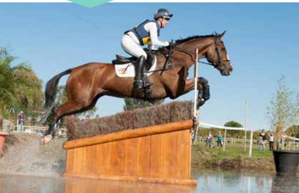
'One Two Many' at Pau CCI 4_ in 2016 where he finished fourth.

“Last year was my first visit to Kelsall Hill and I was hugely impressed by the event, the cross country courses and the going. Amongst other horses, I am bringing 'One Two Many' who was part of the British team that won Team Silver at Blair European Championships 2015.